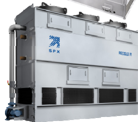
SPX / Marley Cooling Towers and Fluid Cooler Products