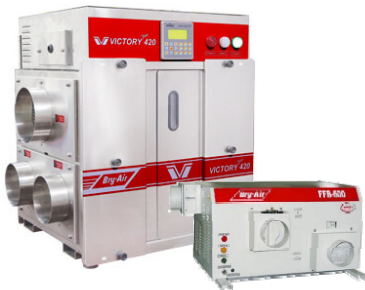
Bry-Air Dehumidification Products