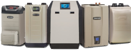
Weil-McLain Commercial Boilers