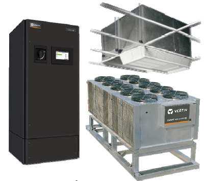
Vertiv / Liebert Packaged Thermal Management Systems