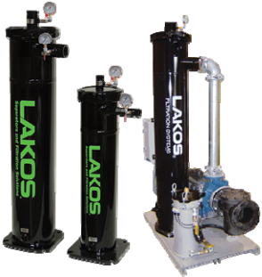
Lakos Centrifugal Separators