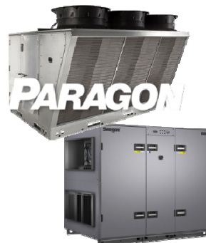
Swegon / CaptiveAir DOAS Systems