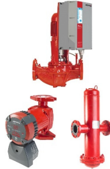
Armstrong Pumps and Accessories