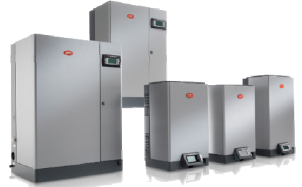
Carel Humidification Products