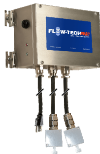
Flowtech Chemical Free Water Treatment