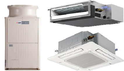
Mitsubishi VRF and Split Systems